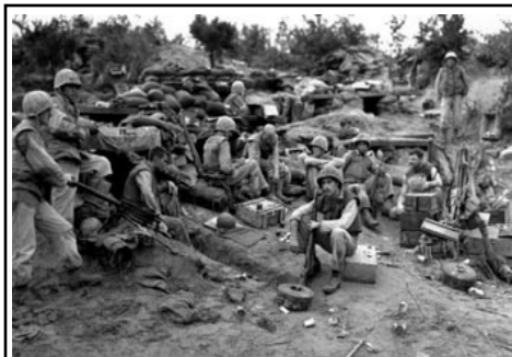
Tired Marines of Company F, 2d Battalion, 1st Marines, unwind during a pause in the fighting on Bunker Hill.

Come down and spend a great afternoon with your Comrades and Sisters at the Post.