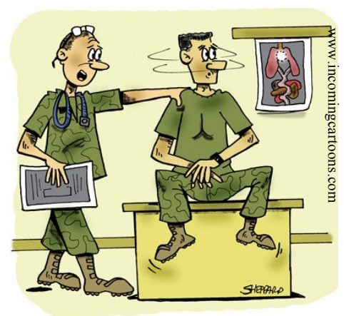
"They're right, Sarge! You have no heart!"