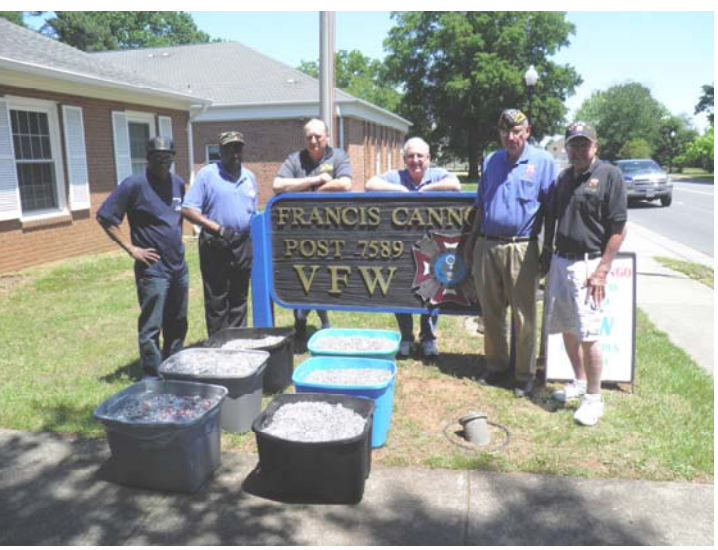
2017 PHOTO BY LARRY CLANCE

To date more than three million tabs have been collected for this Post 7589 program which has now been made a permanent element of the Post 7589 community service program.