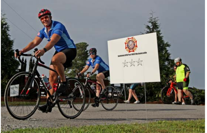
VFW Posts across the state of Virginia contributed to the fundraiser. Our biggest contributor was VFW Post 9808 Mechanicsville.