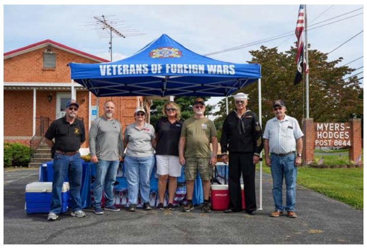
VFW Post 8644 Bridgewater at rest stop #3