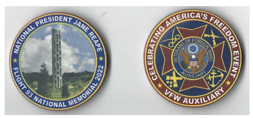
2022 Celebration Of America's Freedom Event token for participation