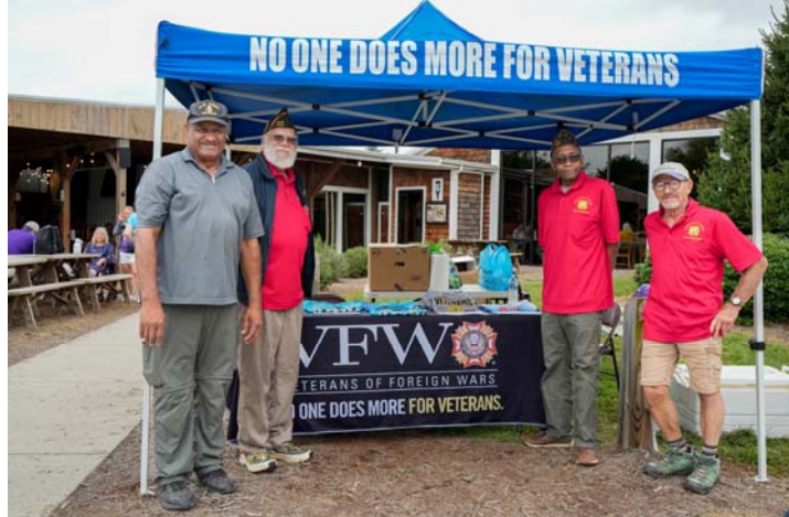
VFW Post 7814 at Stable Craft Brewing