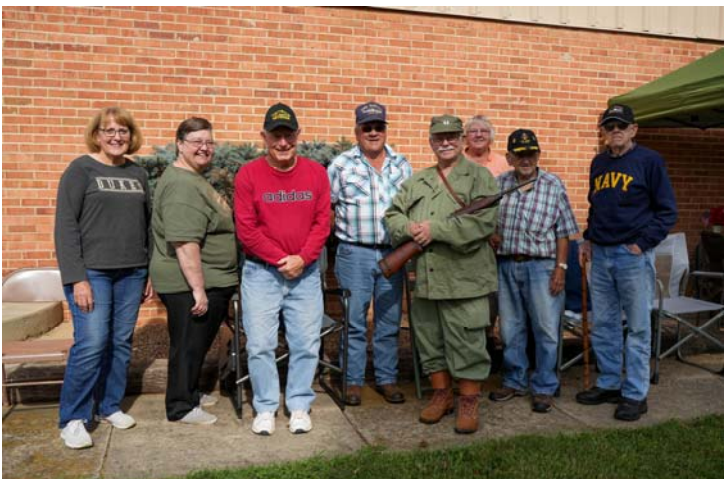
VFW Post 3136 & Auxiliary, Mount Solon at rest stop #2